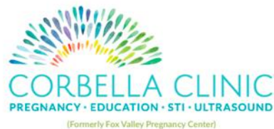
TABLE HOSTS NEEDED! Invite your friends to an unforgettable evening of food, fun, and fellowship. Contact us if you can host a table of 10 seats and help us reach our goal of 40 tables.

847-697-0200 or Jeanna@corbellaclinic.org